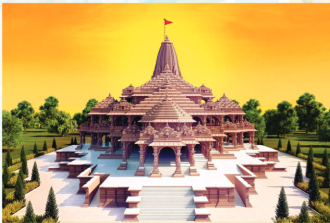
Upcoming Ram Mandir, Ayodhya