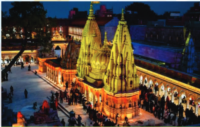
Shri Kashi Vishwnath Temple