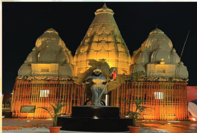
Bharat Mata Temple